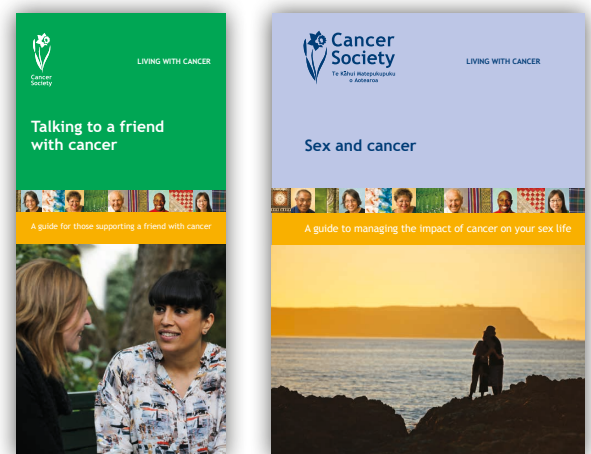
Some of the new editions published this year.

You can read our publications by visiting our website: www.cancernz.org.nz . You can also receive copies by phoning the Cancer Information Helpline 0800 CANCER (226 237) , or by contacting your local Cancer Society.