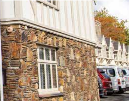
Daffodil House, 91 Papanui Road is one of two accommodation venues for patients who need a home-away-from-home while receiving cancer treatment in Christchurch.