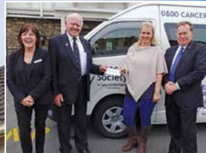
Generous support from South Island Lions Clubs keeps our daffodil shuttle on the road, running 12 times each day ferrying patients from our accommodation to Christchurch Hospital for treatment.