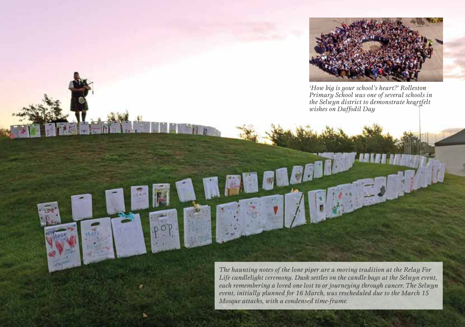
'How big is your school's heart?' Rolleston Primary School was one of several schools in the Selwyn district to demonstrate heartfelt wishes on Daffodil Day

The haunting notes of the lone piper are a moving tradition at the Relay For Life candlelight ceremony. Dusk settles on the candle bags at the Selwyn event, each remembering a loved one lost to or journeying through cancer. The Selwyn event, initially planned for 16 March, was rescheduled due to the March 15 Mosque attacks, with a condensed time-frame.