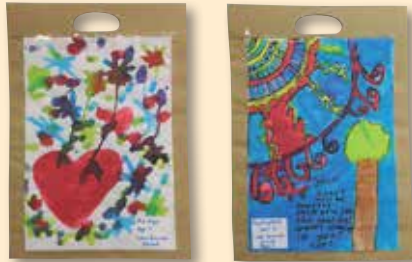
A small way to make a difference in someone's life

Having cancer can be hard but getting help shouldn't be! That is why we operate an 0800 CANCER (0800 226 237) free helpline with