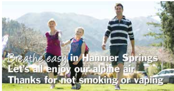
Breathe Easy in Hanmer Springs

The first evaluated trial of a smokefree and vape-free town centre – Breathe Easy Hanmer Springs – was launched in February in partnership with Canterbury DHB and the Hurunui