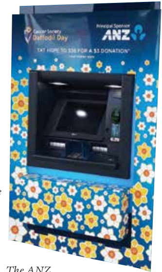
The ANZ Bank is the Cancer Society's principal sponsor for Daffodil Day.