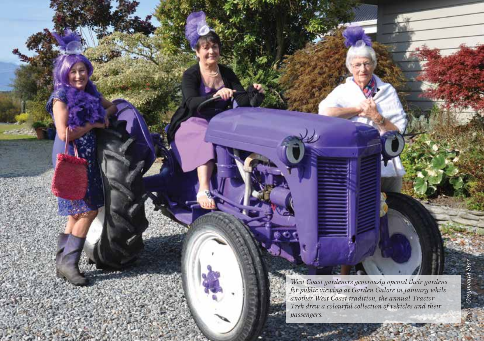
West Coast gardeners generously opened their gardens for public viewing at Garden Galore in January while another West Coast tradition, the annual Tractor Trek drew a colourful collection of vehicles and their passengers.