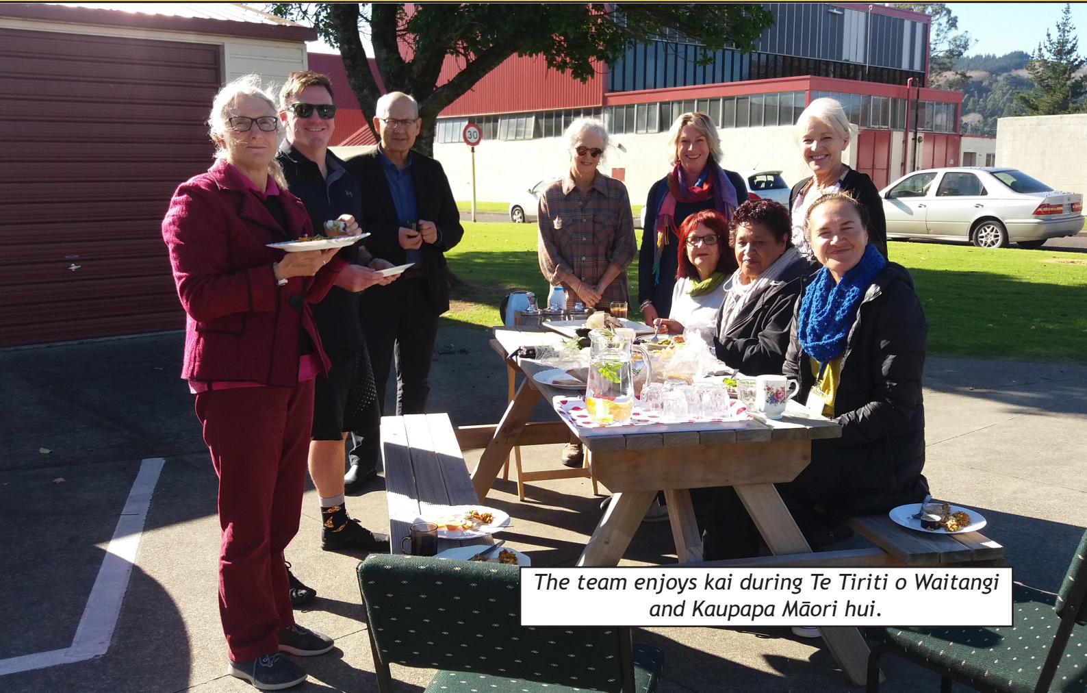
The team enjoys kai during Te Tiriti o Waitangi and Kaupapa Māori hui.