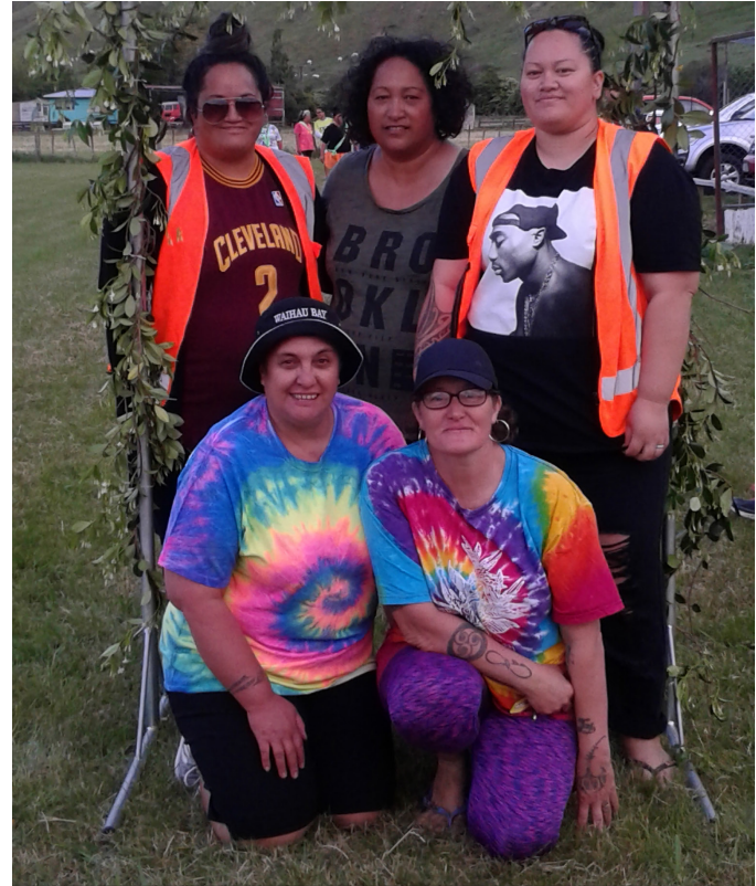
The amazing Waikohu Hikoi for Hope organising committee.